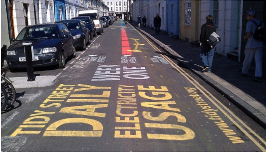
Fig. 3. Tidy Street: Measuring and Publicly Displaying Domestic Electricity Consumption (Photo taken by Nora O’Murchu)