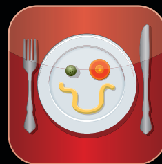
Stay Hungry, Stay Foolish