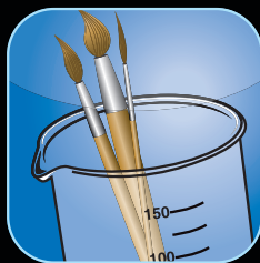
Combine the Humanities with The Sciences