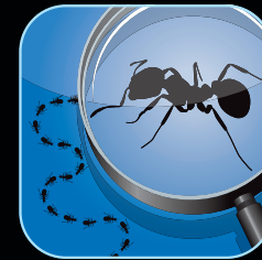
Know Both the Big Picture and The Details