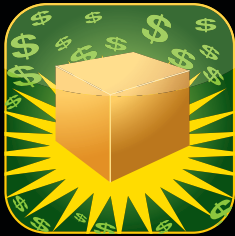
Put Products Before Profits