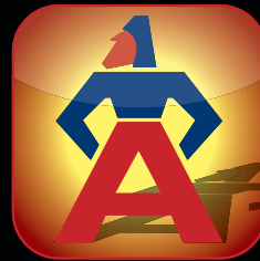
Tolerate Only "A" Players