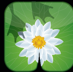
When Behind, Leapfrog