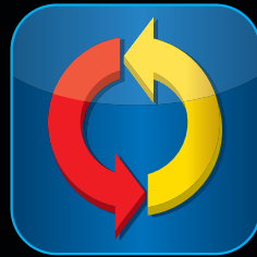
Take Responsibility End to End