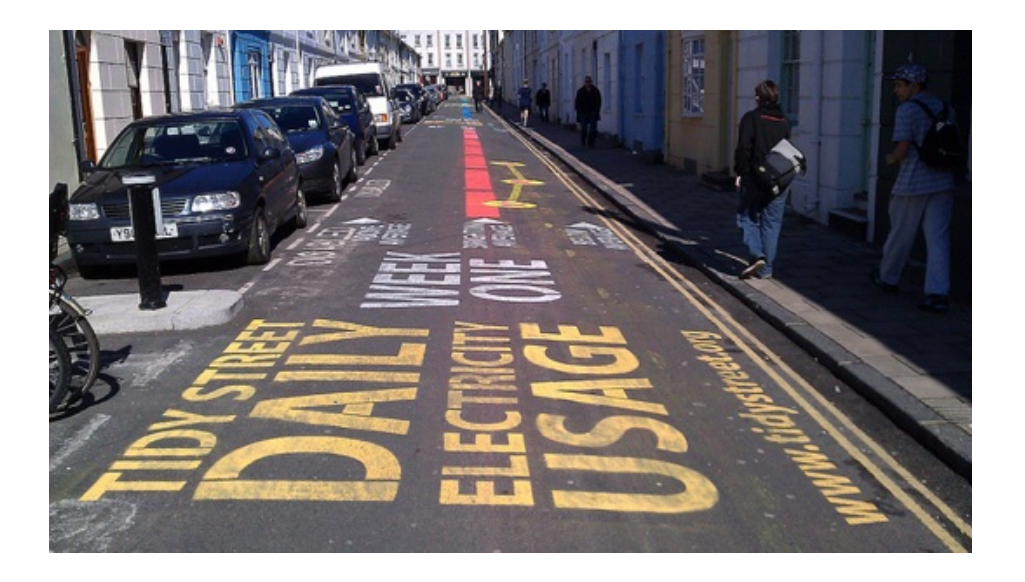
Fig. 3. Tidy Street: Measuring and Publicly Displaying Domestic Electricity Consumption